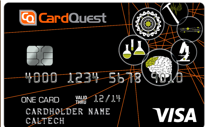
Winning New P-Card Design, available February 2017

U.S. Bank has over 20 years of extensive higher education experience with more than 500 Higher Educational clients. For more information please click here .